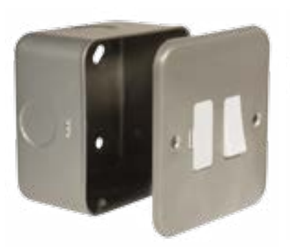
Supplied with multiple knockout metal box