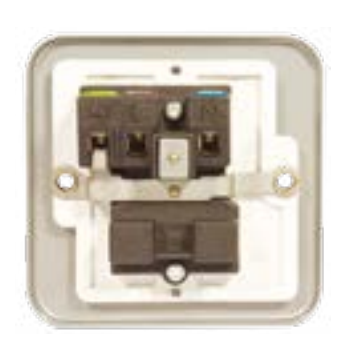
Angled in-line colour coded captive terminals