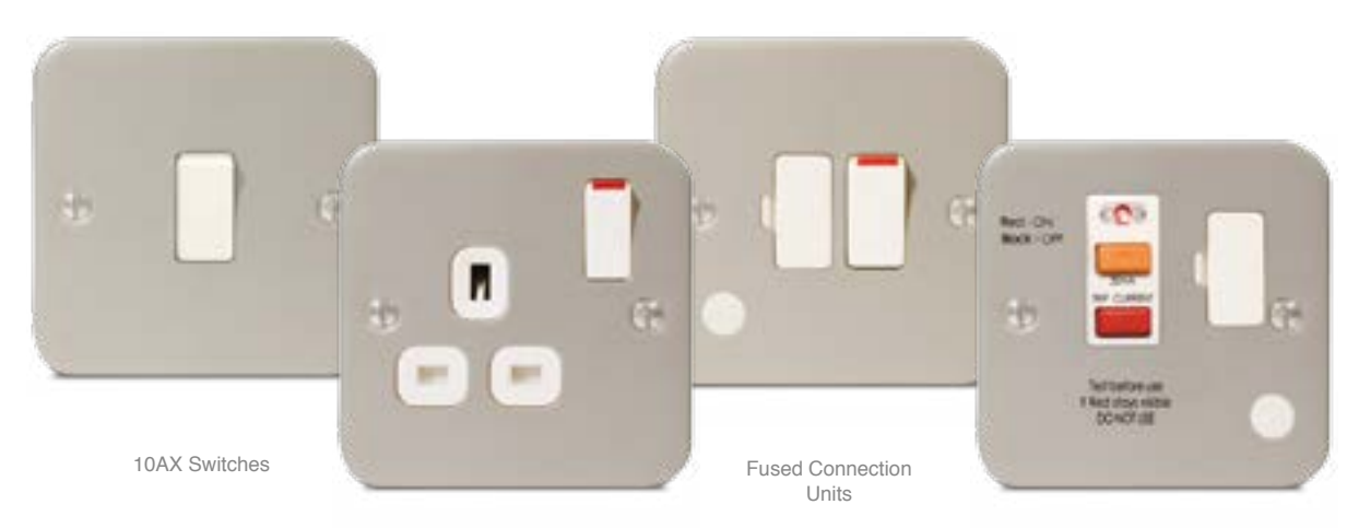
13 Amp Sockets