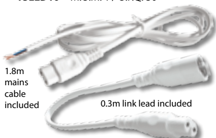
1.8m mains cable included