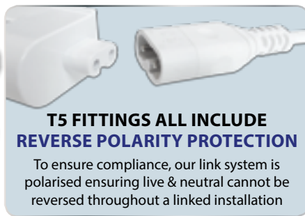
0.3m link lead included