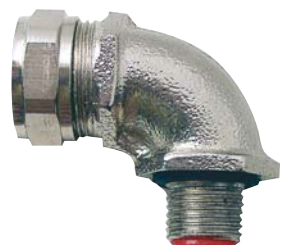
Type C90 90° Combined Fitting & Elbow