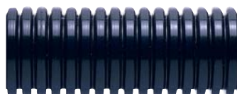
Type PA Heavyweight Conduit