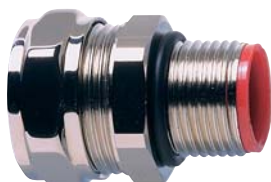
Type A Straight Fitting