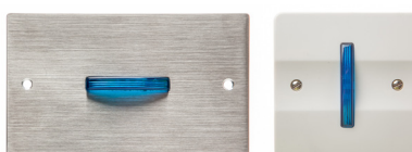
HARK™ Indicator / Sounder units