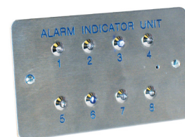
HARK™ Alarm Indicator unit in Stainless Steel finish and Reset unit