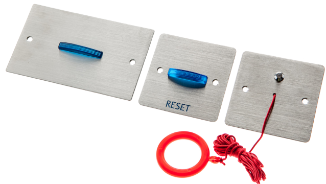
N/HARK+ Stainless steel kit option complete with battery back up and "call acknowledge" feature

These units can be purchased as either 1 or up to 11 indicators and come finished in either White Polycarbonate or Stainless Steel. Custom engraving is available.