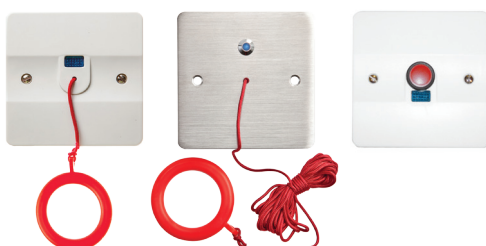
HARK™ Pull cord units and Push Button Option Available in Stainless steel or white polycarbonate

The Overdoor indicator/Sounder unit is supplied with an integral Power supply unit. A fused spur should be fitted nearby and wired to this unit to provide power. The unit will illuminate and sound as soon as a call is activated. The unit will cease once the reset switch is pressed.