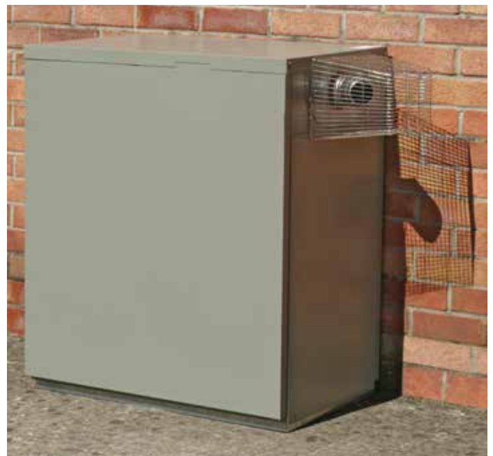
Model shown: Grant Vortex Eco External Module

Eco External boilers can be converted to sealed system operation by purchasing a pre-assembled kit from Grant UK (Product code: VTXECOSSKIT35). The sealed system kit includes an expansion vessel, automatic air vent, pressure relief valve and circulating pump. A filling loop and pressure gauge are also supplied as part of the kit. These can be fitted within the module casing, or ideally in a convenient site within the building, located between the cold main and central heating return.