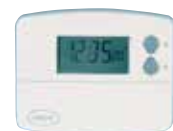
Optional Grant RS Kit Wall-Mounted Programmable Room Thermostat.