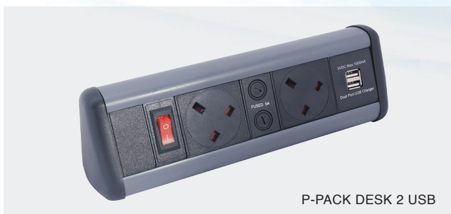
P-PACK DESK 2 USB