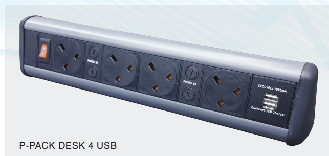
P-PACK DESK 4 USB