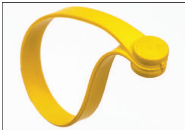
Cable Koala Tie.